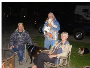
April Woodson Bridge

After sampling the wines we were escorted over to another building to see the