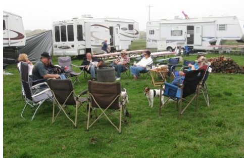
Dillon Beach way back when we could circle up in the meadow.