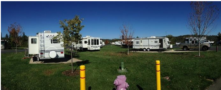
Jackson Rancheria - October 2016