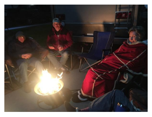
(French Camp, Continued)

Tuesday night everyone drove into Stockton to Angelina's that is an Italian restaurant that has been around for over 40 years. The food is outstanding and their minestrone soup is probably one of the best minestrone soup I have ever had. Everyone enjoyed it immensely.