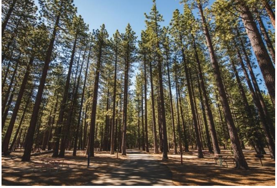
Sunny Shores and Towering Pines

1175 Melba Dr South Lake Tahoe, CA 96150