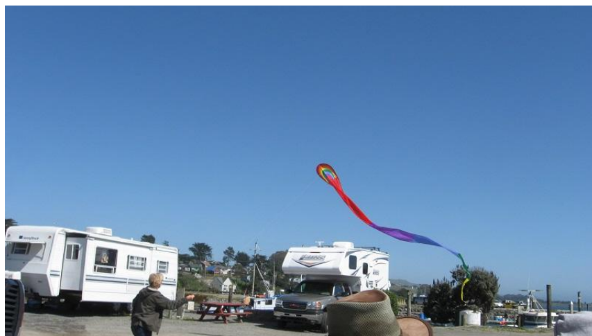
Porto Bodega 2013

I am finalizing the new rosters and will have them available in a another weeks.