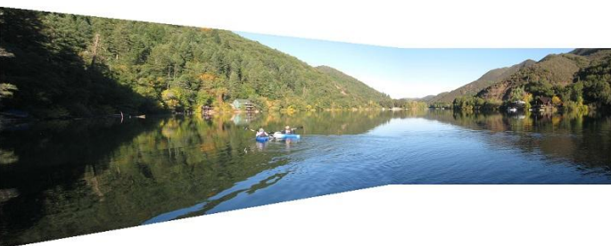
Blue Lakes October 2013

December 6 - Christmas Party. Larry Cooper