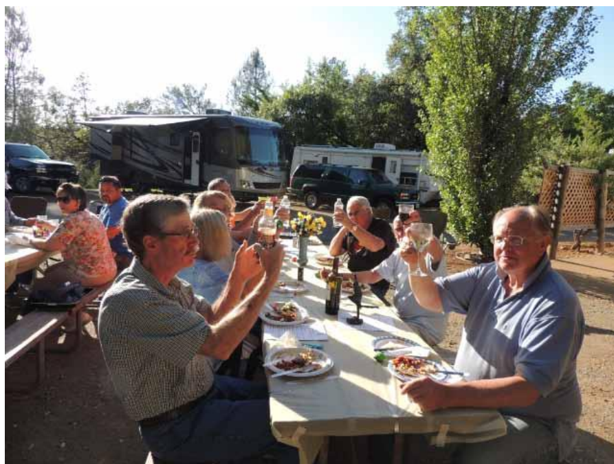
Here's to ya... Marble Quarry, May 2013