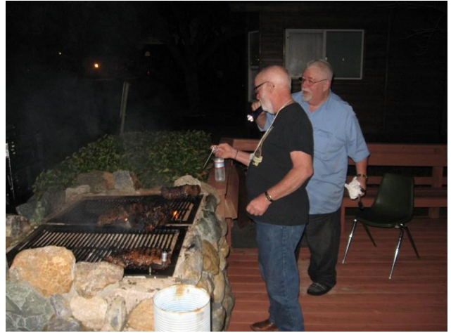
Checking the Tri-Tips at 49er Village