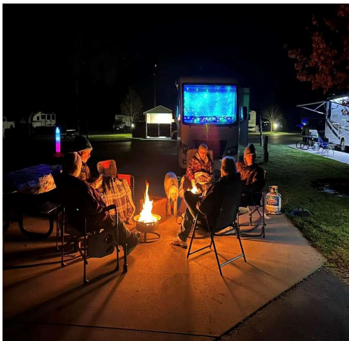
January 2025 Jackson Rancheria