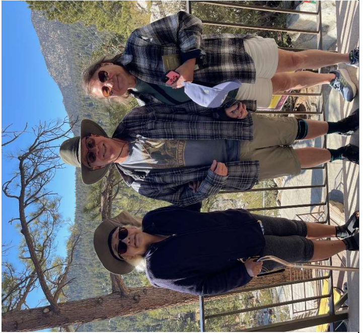
Coachella Outing Feb 2025